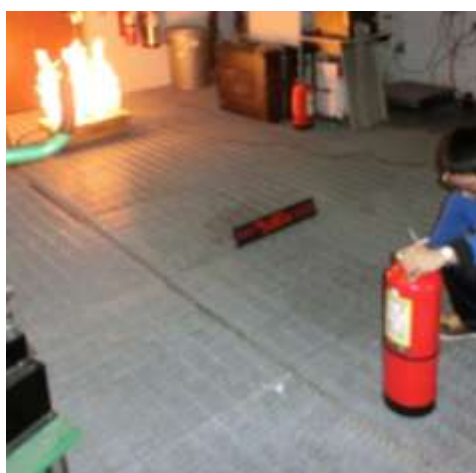
Figure 8: Participant viewing the label on the BullEx Smart Extinguisher while BullEx ITS was active

Table 3, Percent Improvement with Training for Key Milestones of Usage, shows the percentage improvement from Trial 1 to Trial 2 for key milestones of usage. Overall, all 276 participants were able to discharge agent. There was a 46% decrease in discharge agent time. And there was a 20% decrease in reading the label.