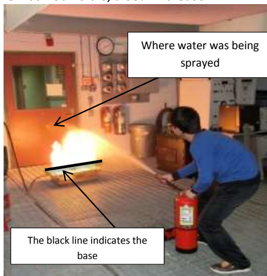
Figure 9: Participant aiming above the base of the BullEx ITS

Table 6, Percent Improvement of Technique in Handling a Fire Extinguisher, shows the percentage improvement from Trial 1 to Trial 2. Overall, 276 participants improved their ability to aim at the base of the fire by 21%, so 93% aimed at the base. Participants improved their ability to use the proper sweep technique by 22%, so 96% used the sweeping back-and-forth motion. Finally, 83% of participants continued to spray after the fire was not visible, a 35% increase.