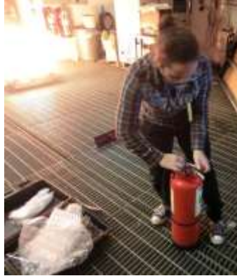
Figure 17: Participant turning back to the fire while attempting to free the pin from the BullEx Smart Extinguisher

Figure 17 shows a participant turning her back to the fire. The participant immediately turned her back to the fire to read the label and then attempted to free the pin from the fire extinguisher.