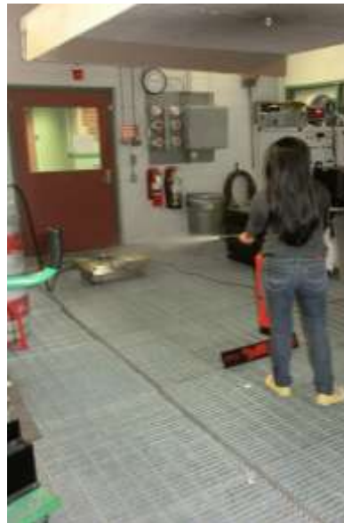
Figure 14: Participant continuously deploys agent on propane fire, thereby preventing re-ignition

Figures 12 and 13 shows a participant extinguishing the fire but not continuing to deploy agent. The fire re-ignites in Figure 13 as the participant begins to turn away from the fire.